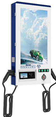
7kw/14kw Vertical/Walls advertising AC charging point